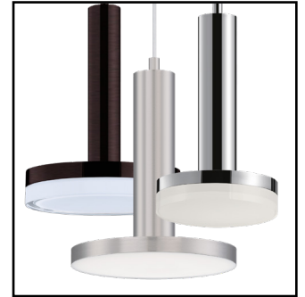
57600 PENDANT ACCESSORY (Sold Separately, Fixture NOT included)