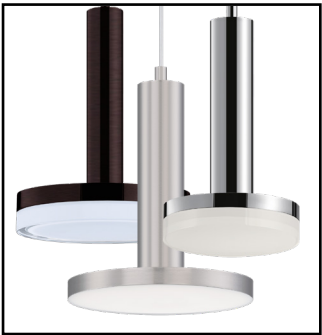
57600 PENDANT ACCESSORY (Sold Separately, Fixture NOT included)

Our ever popular flush mount available in an updated form. Featuring die-cast aluminum bases available in Satin Nickel, Polished Chrome or Bronze with dimensional acrylic diffusers. Clear on the outside and Frost on the inside creating an intriguing optical effect. With increased lumens and better pricing this collection is the second generation in an already famous collection. Use the optional pendant adapter to convert any size to a hanging fixture.