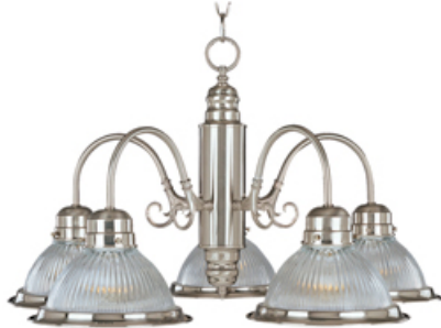
91195CLSN Builder Basics 5-Light Chandelier