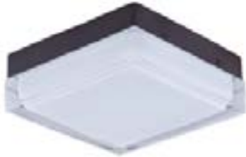
87644CLWTBZ Illuminaire LED Flush Mount