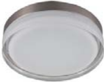
87632CLWTSN Illuminaire LED Flush Mount