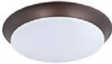
87599WTBZ Profile EE LED Flush Mount