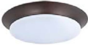
87598WTBZ Profile EE LED Flush Mount