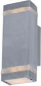
86129AL Lightray 2-Light LED Wall Sconce