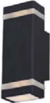
86129ABZ Lightray 2-Light LED Wall Sconce