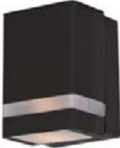
86128ABZ Lightray 1-Light LED Wall Sconce