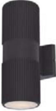
86123ABZ Lightray 2-Light LED Wall Sconce