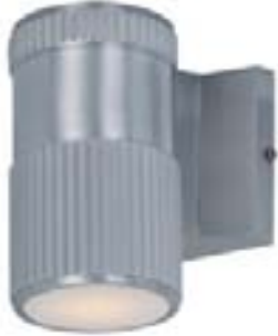
86122AL Lightray 1-Light LED Wall Sconce