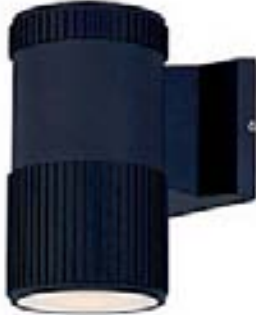
86122ABZ Lightray 1-Light LED Wall Sconce