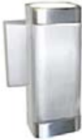
86109AL Lightray 2-Light LED Wall Sconce