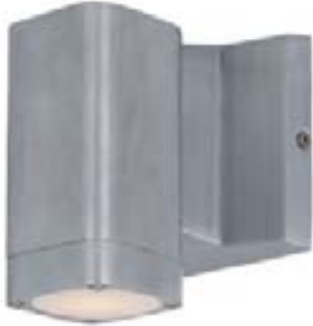
86108AL Lightray 1-Light LED Wall Sconce