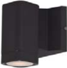
86108ABZ Lightray 1-Light LED Wall Sconce