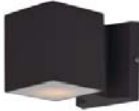
86107ABZ Lightray 2-Light LED Wall Sconce