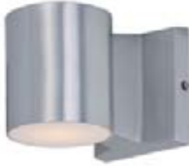
86106AL Lightray 2-Light LED Wall Sconce