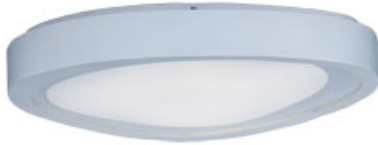
85853WTWT Nebula LED Flush Mount