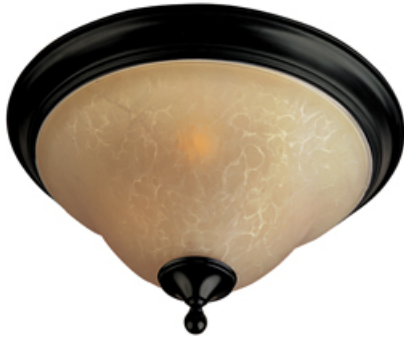
85801WSOI Linda EE 3-Light Flush Mount