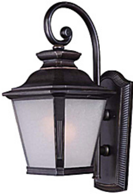
85627FSBZ Knoxville EE 1-Light Outdoor Wall Lantern