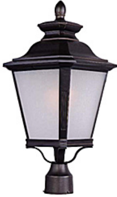
85621FSBZ Knoxville EE 1-Light Outdoor Pole/Post Lantern