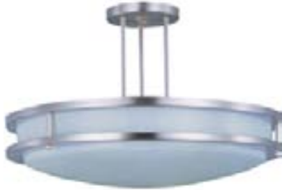
85548WTSN Linear EE 2-Light Semi-Flush Mount