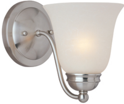
85131ICSN Basix EE 1-Light Wall Sconce