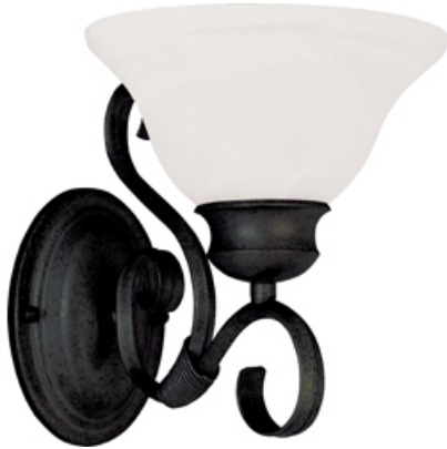
8021MRKB Pacific 1-Light Wall Sconce