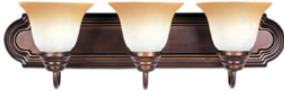
8013WSOI Essentials 3-Light Bath Vanity