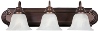
8013MROI Essentials 3-Light Bath Vanity