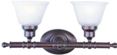
7142FTOI Essentials 2-Light Bath Vanity