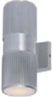
6126AL Lightray 2-Light Wall Sconce