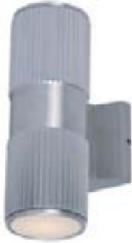
6123AL Lightray 1-Light Wall Sconce