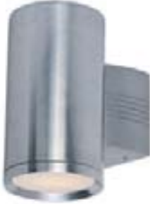
6101AL Lightray 1-Light Wall Sconce