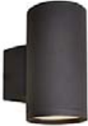
6101ABZ Lightray 1-Light Wall Sconce