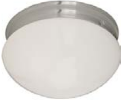
5881WTSN Essentials 2-Light Flush Mount