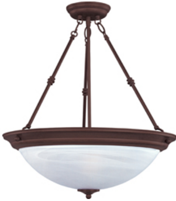
5845MROI Essentials 3-Light Invert Bowl Pendant