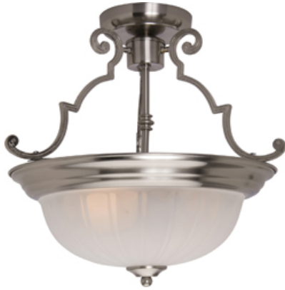
5833FTSN Essentials 2-Light Semi-Flush Mount