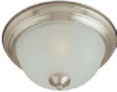
5830FTSN Essentials 1-Light Flush Mount