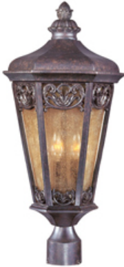
40170NSCU Lexington VX 3-Light Outdoor Pole/Post Lantern