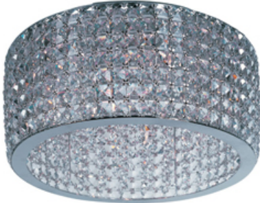
39930BCPC Vision 9-Light Flush Mount