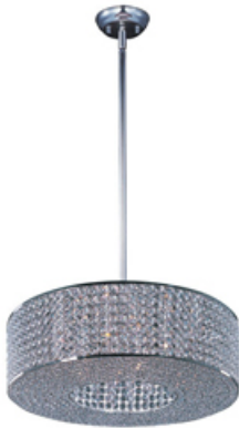
39896BCPS Glimmer 10-Light Pendant