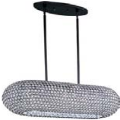
39880BCBZ Glimmer 10-Light Pendant