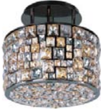
39791JCLB Fifth Avenue 6-Light Flush Mount