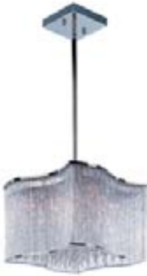
39704CLPC Swizzle 12-Light Pendant