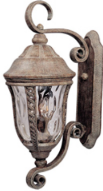
3108WGET Whittier Cast 3-Light Outdoor Wall Lantern