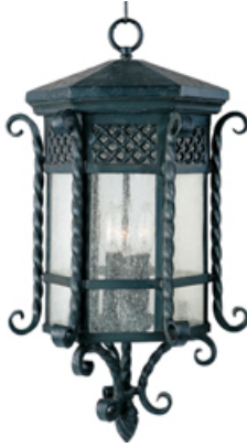
30129CDCF Scottsdale 3-Light Outdoor Hanging Lantern