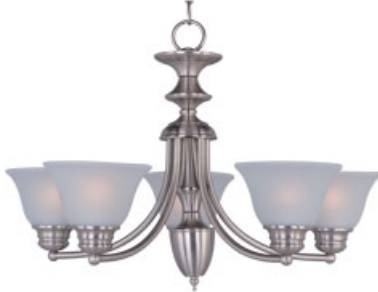
2699FTSN Malaga 5-Light Chandelier