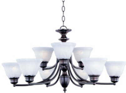
2685MROI Malaga 9-Light Chandelier