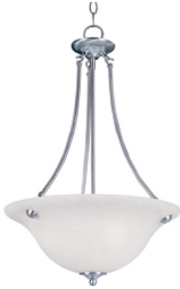
2682MRSN Malaga 3-Light Invert Bowl Pendant