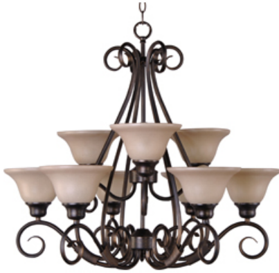
2658WSKB Pacific 9-Light Chandelier