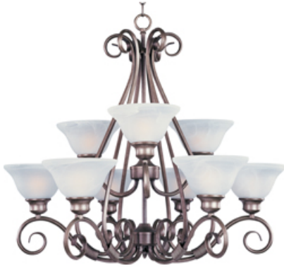
2658MRPE Pacific 9-Light Chandelier