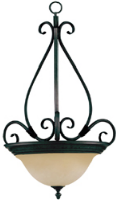
2654WSKB Pacific 3-Light Pendant